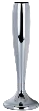
Flower Vase No. 764309 No. 864309 H9