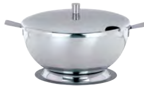
Cheese Server with Lid No. CHS-600 6 oz./ D4%