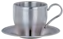
Espresso Cup No. CC 300 3 ounce