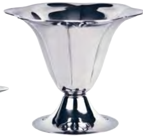
Tulip Sundae Dish No. 99513306 7 ounce H3¾ D4¾