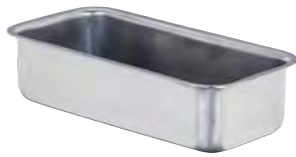
Sugar Packet Holder No. 762305 No. 862305 L5¾ W2¾ H1½