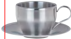
Cappuccino Cup No. CC 100 7¼ ounce