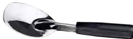
Ice Cream Paddle No. ICP-1 L9