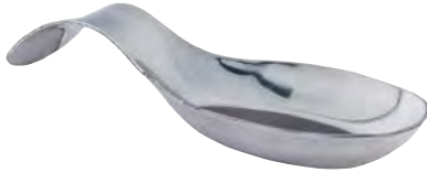
Spoon Rest No. SR-100 L8